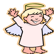
TLCs are "Green Angels"

with others just like you around our area, to share ideas and suggestions. Service Unit Directors should email me, the contact info for their team asap, ( PSMetro3@girlscoutsnwga.org ) Metro 1's training will be on 9/17 if you miss ours and mark your calendars for the Conference on Jan 14th. So...do YOU care enough...I hope so, and hope to hear from you soon.